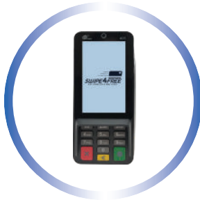
PAX A35 PIN PAD Android OS

HD touch screen with built-in Dual Pricing software