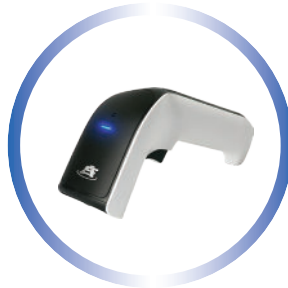
BARCODE SCANNER Wireless