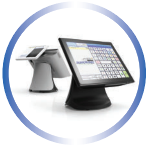
CUSTOMER/MERCHANT FACING DISPLAY

Swipe4Free has created a customized POS bundle perfect for all deli/grocery, restaurant, and retail merchants interested in using our Dual Pricing platform. Dual Pricing is the only 100% compliant form of Cash Discounting and is defaulted into the Swipe4Free JK POS Bundle.